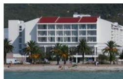
Conference Venue - Sea side area

Bar, Montenegro December 12 th – 14 th , 2024