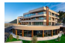
Venue for Gala Dinner Lake side area